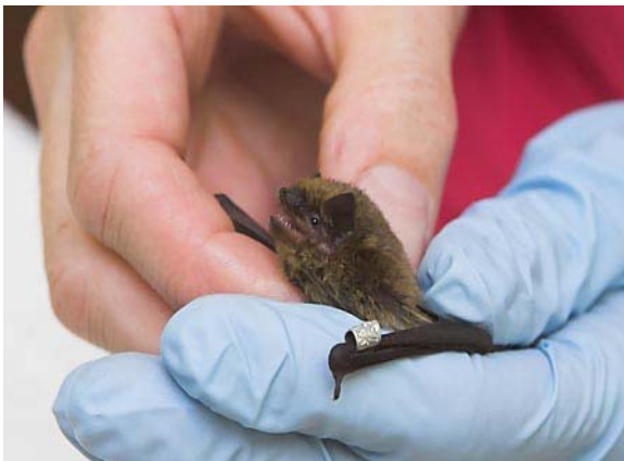
Pipistrelle bat showing aluminium ring.

The work being undertaken with various wild species was detailed to demonstrate specific difficulties being encountered and the very different approaches required. In terms of monitoring, a variety of methods are utilised to suit different species, these include radio-tracking; satellite tracking; ring recoveries; microchip and tattoo identification. Recent studies by the RSPCA wildlife centres have shown good post-release survival in several species including pipistrelle bats 8 , tawny owls 9 and polecats 10 .